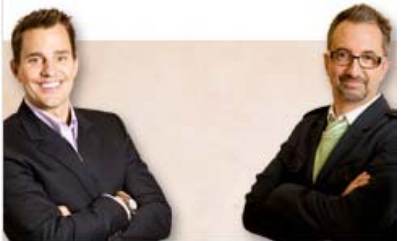
Bill Rancic Business Expert